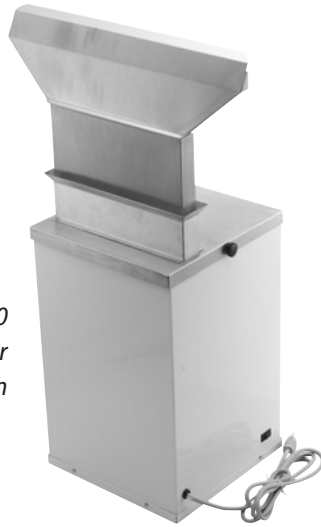
Model AF350 Downdraft Air Filter System