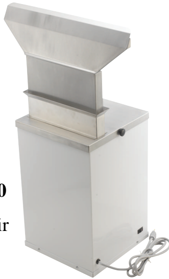
Model AF350 Downdraft Air Filter System

Project: _____ Item #: _____ Quantity: _____ Model #: _____